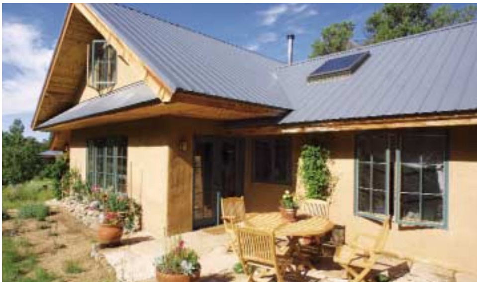
A different house, but the same ecological consciousness. Unlike the author's own home, which is strongly influenced by Japanese architecture, this house has a more traditional Southwestern look (as well as a second-floor master bedroom). Unplastered adobe bricks have been laid up to form interior walls, eliminating the need for drywall, joint compounds and paint.

mica and natural pigments can create a large palette of color and texture.