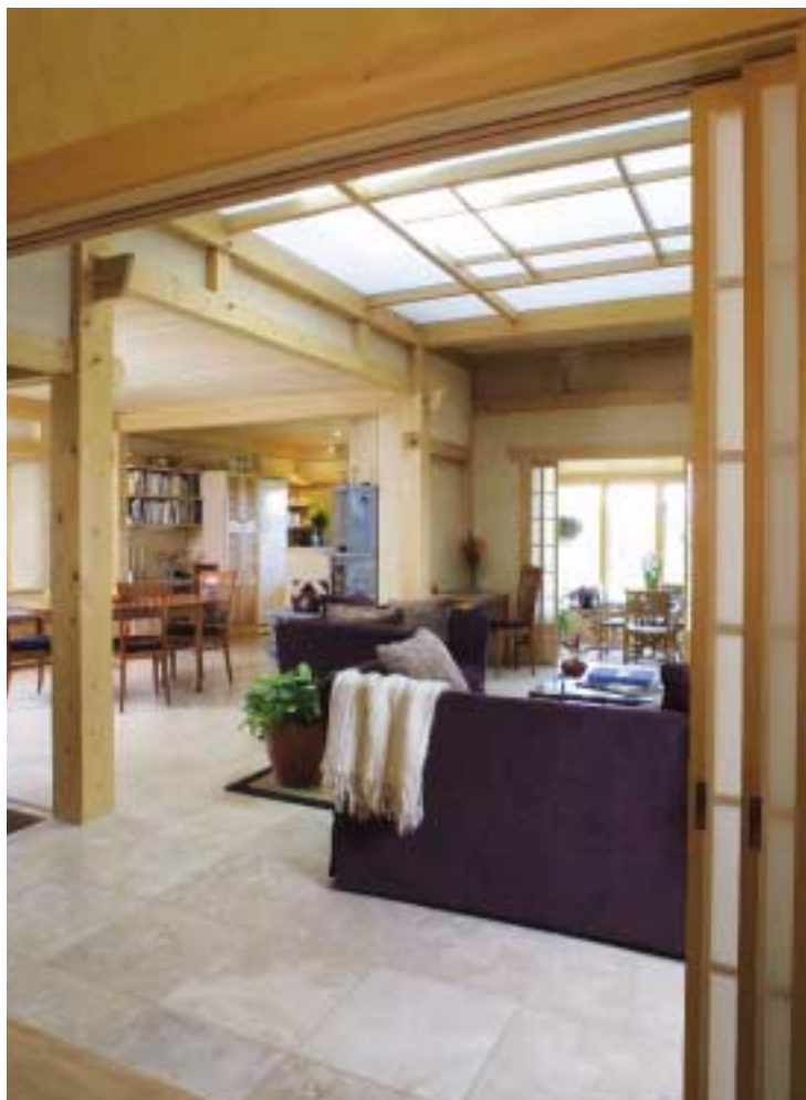
Long views, small house. Inside, the open floor plan helps this 1400-sq. ft. house to feel larger, while the timber-frame structure defines the spaces. Outside (facing page), the house sits on a southern slope overlooking the author's architecture studio.

Santa Fe is a special place. The climate is dry and relatively mild. The sun shines at least 330 days a year. We don't even have mosquitoes. But most important for our work, there is an tradition of natural building here and generations of skilled craftspeople to carry the tradition forward. Consequently, building inspectors are used to dealing with mud.